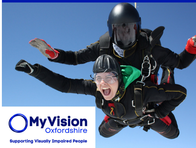
A photo of two people skydiving. The MyVision logo is on the left hand side.