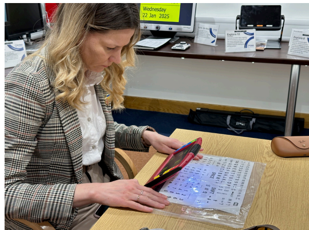
One of the Ukrainians learning to use a digital magnifier

We shared insights into our services, including technology training, social groups, and counseling. The delegates experienced firsthand assistive technologies used by our clients.