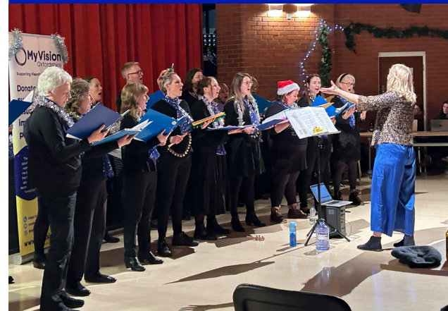
Vocalize Choir, one of the performers at the Christmas Concert.