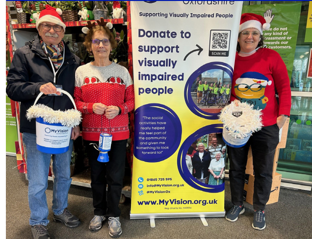
Three of our volunteers at the ASDA bucket collection.