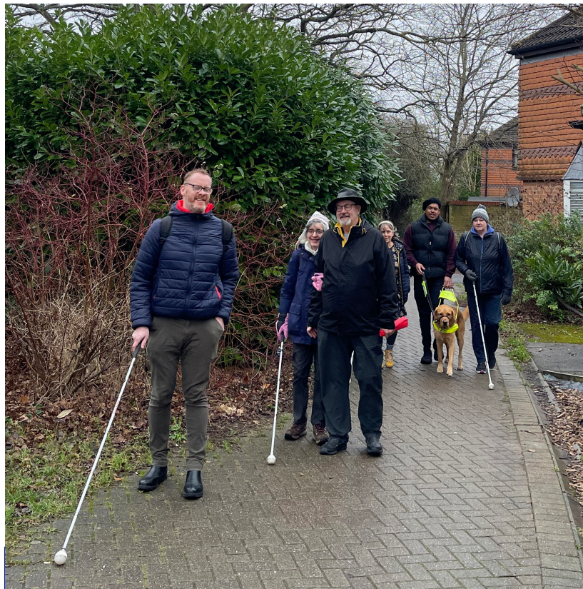
A photo from our first ever Green Walk in Didcot, 23rd January 2024 There is a group of people walking on a path.

..... January 23rd marked the one year anniversary of our first Green Walk! Over the past year, we've enjoyed exploring the county together, and the company of like minded people. We're incredibly grateful to everyone who has joined us on these walks and made them such a success. Keep an eye on the events calendar for upcoming Green Walk dates and join us for another year of outdoor adventures!