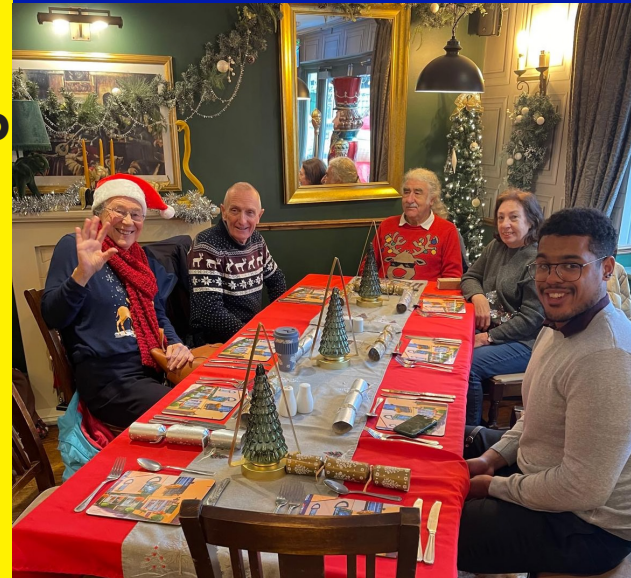
The Thame Group meeting up for their Christmas lunch. They are sitting around a table, waiting for food with Christmas Crackers

For more information on our Social Groups, visit our website, or contact us at Info@MyVision.org.uk