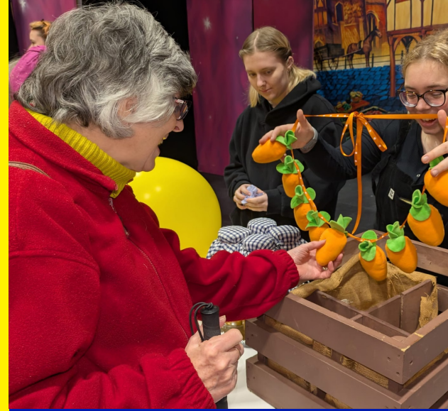
A woman from the Didcot group feeling props and a pantomime.