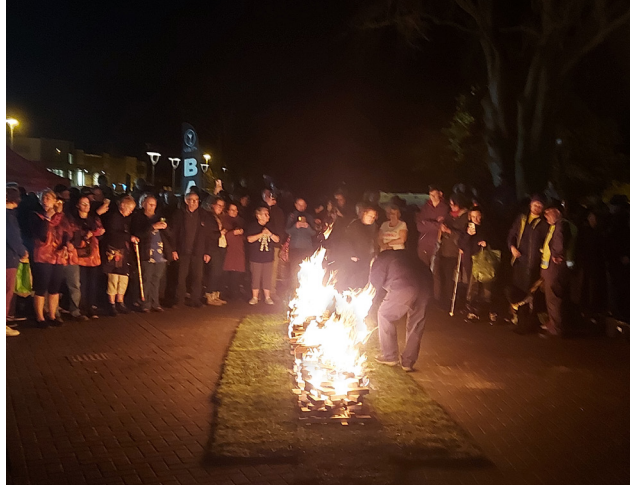
A photo from last years Firewalk. There is a large group of people standing around the fire.

If you have an idea of your own, or you'd like to get involved another way, let us know and we can help you get your plans off the ground! Contact Fundraising@MyVision.org.uk .